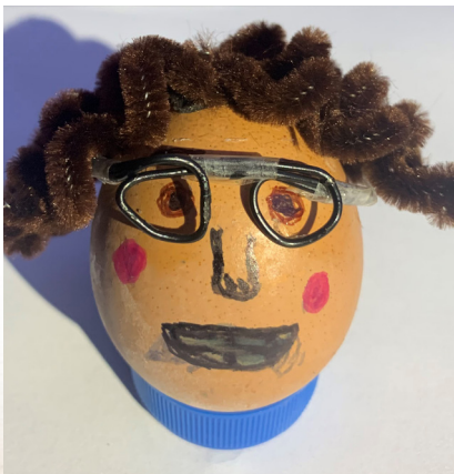
RUNNER UP Isaac Buddles